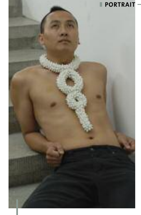
His latest project is a work which uses paper. Here, the artist wears one of his own ostentatious paper chains