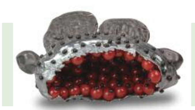
...sometimes it is combined with beads to form a chain and sometimes sliced open to explore what surprises await inside